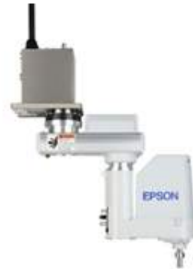
Epson Spider – a SCARA without dead space

Even very simple design improvements can have a truly incredible effect. For example, the SCARA Epson RS Spider, launched in March 2009, hangs from the ceiling like a spider. By so doing, the second arm can maneuver under the first arm eliminating the classic Achilles' heel of the SCARA: the "kidney shaped" workspace including the dead space. The deep swiveling Spider can reach each point within a cylindrical work envelope. Thanks to its improved kinematics, the standard SCARA's need to maneuver around its base to get into position has been eliminated. Instead of this, the Epson RS SPIDER takes the direct route, thereby reducing cycle times up to 15 percent vs. conventional SCARA and that with minimum footprint. The Spider is perfect for cramped spaces like, for example, in cleanrooms of pharmaceutical companies and (micro)chip manufacturers where it is vital to optimise use of existing space.