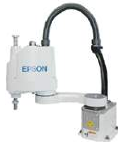
Epson G3 Sinus – the second last development step