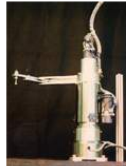
Epson 1 – the first Epson SCARA

Epson is one of the pioneers in the SCARA robot segment. Originally these machines were used solely for internal applications at Epson's sister company Seiko (subsequently Seiko Epson Corporation) for the production of watches. However, Epson has steadily continued to refine and advance SCARA technology, enabling the machines' availability on the open market since 1984. Today's latest developments are reflected in the development of the G3 SCARA series. The sine and cosine models of the series, launched in February 2009, feature a flexible arm that can be rotated to the left (sine) or to the right (cosine). Thanks to this innovative, patented solution the robots can simultaneously achieve maximum reach with minimum footprint: The sine/cosine models are the only SCARA of this size on the market with a reach covering more than an entire DIN A4 sheet. Thanks to the enlarged working envelope it is also possible to use even more compact models.