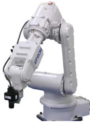
Epson's 6-axis robots round out the broad portfolio of handling robots

from 2004 onwards Epson has enhanced its portfolio of small size handling robots by a series of 6-axis robots. The Epson Pro Six family provide superior performance along with our industry leading PC based controls. Whether you are looking for high speed, low vibration, higher payloads, more reach, or robots for special environment use, Epson has the Pro Six model to fit your application requirements. The rigid arm designs combined with advanced Epson servo control technology results in high speed motion and low vibration even when high precision high speed cycles are required. All Pro Six 6-Axis robots feature brakes on all axes and most models have the flexibility of being mounted in table top, wall or ceiling configurations. Epson Pro Six Robots are ideal for applications where 6 axis dexterity is required such as: small parts assembly, dispensing, lab automation, machine tending, material handling, medical device manufacturing, packaging, food handling and many other applications requiring speed, precision and/or smooth motion.