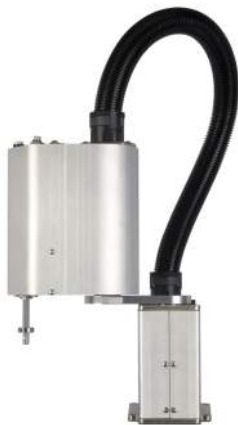
The Epson Miniscara robot prototype – ready for small site assembling

Optionally, Epson offers a broad range of efficient supplementary features: In addition to a Vision System and Conveyor Tracking System, a sensor to measure forces applied is also available. The advantage of all options: They can be seamlessly integrated into the programming surface and activated via the Epson language.