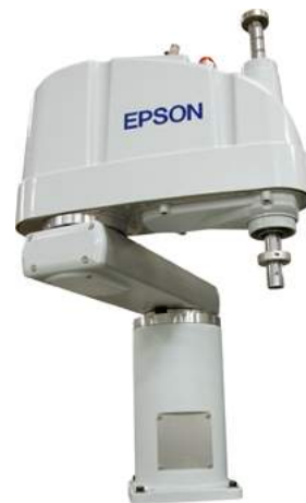
Epson offers the largest portfolio of SCARA robots available on the market